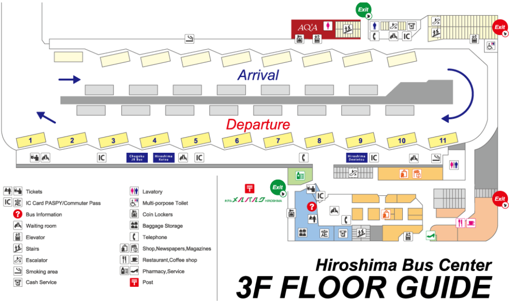
Hiroshima Station map